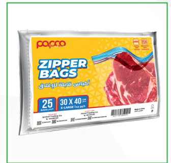
X-Large 20 BAGS 30 X 40 CM 60 Micron Carton Packing: 24