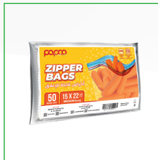
Medium 50 Bags 15 X 22 CM 60 Micron Carton Packing: 24