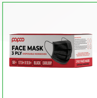
FM-BLK 17.5 CM X 9.5 CM 50 Pcs Carton Packing: 40