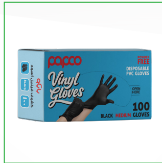
GBLK-M Medium 100 Pcs Carton Packing: 10