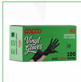
GBLK-L Large 100 Pcs Carton Packing: 10