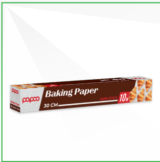
BP-01 30CM X 10M 40 Gsm Carton Packing: 24

Our non-stick baking paper provides a convenient and hygienic solution for baking, cooking, and food preparation. Heat-resistant and grease-proof, it prevents sticking and ensures easy cleanup in both professional and home kitchens. Available in rolls and pre-cut sheets to suit different production needs.