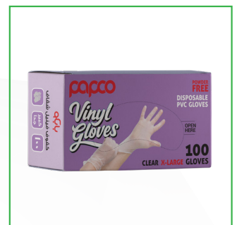
GC-XL X Large 100 Pcs Carton Packing: 10