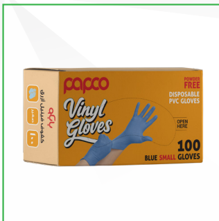
GBLU-S Small 100 Pcs Carton Packing: 10

Our blue vinyl gloves provide a safe and hygienic solution for food handling, cleaning, and general-purpose tasks. Made from latex-free material to reduce allergy risks, they offer a smooth, comfortable fit and are ideal for high-volume disposable use in kitchens, supermarkets, and industrial settings.