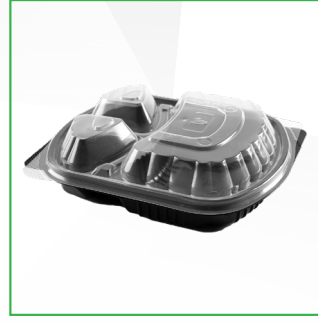
9020 36 OZ 3 Compartment Carton Packing: 250