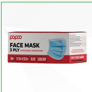
FM-BLU 17.5 CM X 9.5 CM 50 Pcs Carton Packing: 40

Our disposable face masks provide effective protection and comfort for daily use in food service, retail, medical, and industrial environments. Designed for a secure fit and easy breathing, they help maintain hygiene standards while offering a professional appearance. Available in blue and black to suit different workplace needs.