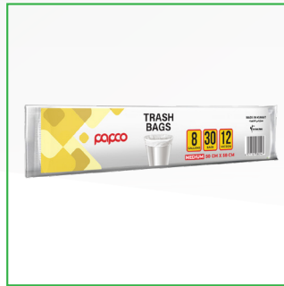
TB-8G Bag Size: 50 x 58 Cm 30 Bag Carton Packing: 80 Roll