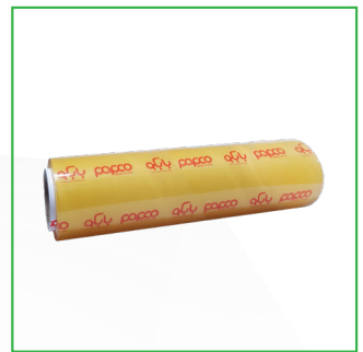
CF-04 45CM X 4.350 Kg 11 Micron Carton Packing: 2