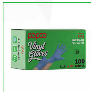
GBLU-L Large 100 Pcs Carton Packing: 10