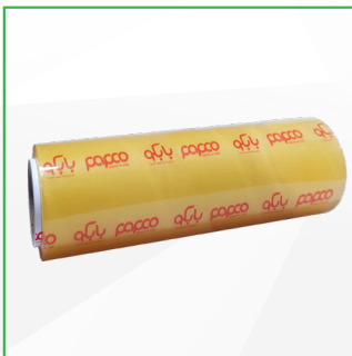
CF-05 45CM X 7 Kg 11 Micron Carton Packing: 1