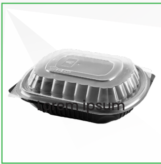
9000 36 OZ 1 Compartment Carton Packing: 250

Our meal containers provide a reliable and hygienic solution for packaging hot or cold meals. Made from durable, food-grade plastic with secure snap-on lids, they are ideal for restaurants, catering services, and meal-prep operations. Their sturdy construction helps maintain temperature, prevent leaks, and ensure safe transport.