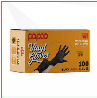
GBLK-S Small 100 Pcs Carton Packing: 10

Our black vinyl gloves provide a safe and hygienic solution for food handling, cleaning, and general-purpose tasks. Made from latex-free material to reduce allergy risks, they offer a smooth, comfortable fit and are ideal for high-volume disposable use in kitchens, supermarkets, and industrial settings.