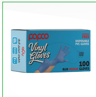
GBLU-M Medium 100 Pcs Carton Packing: 10