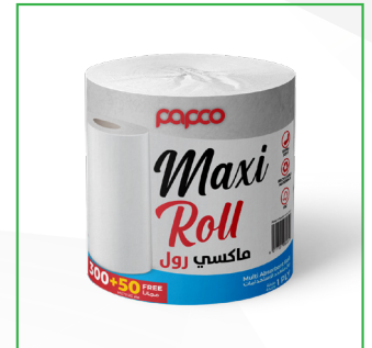
MR-4 350 Meter 1 Ply Carton Packing: 6