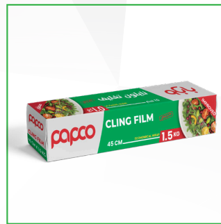
CF-03 45CM X 1.5KG 11 Micron Carton Packing: 6