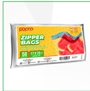
Large 50 BAGS 17 X 25 CM 60 Micron Carton Packing: 24