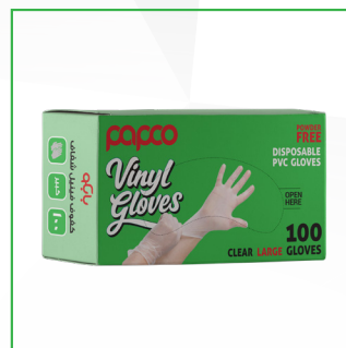
GC-L Large 100 Pcs Carton Packing: 10