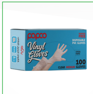
GC-M Medium 100 Pcs Carton Packing: 10