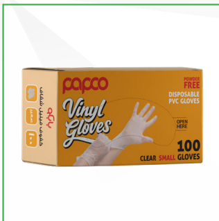
GC-S Small 100 Pcs Carton Packing: 10

Our clear non-powdered vinyl gloves provide a hygienic and comfortable solution for food handling, cleaning, and general use. Made from latex-free material, they ensure safe protection for users with skin sensitivity while offering a smooth, easy-fit design suitable for disposable applications.