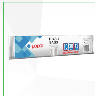
TB-10G Bag Size: 62 x 52 Cm 30 Bag Carton Packing: 54 Roll