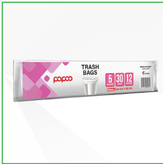
TB-5G Bag Size: 46 x 50 Cm 30 Bag Carton Packing: 60 Roll

Our trash bags are designed for daily waste collection, offering strength and reliability for indoor and outdoor use. Suitable for commercial and household environments.