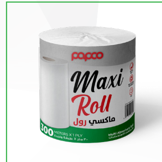
MR-3 300 Meter 1 Ply Carton Packing: 6