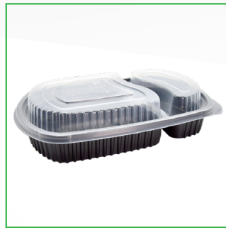
8010 32 OZ 2 Compartment Carton Packing: 250