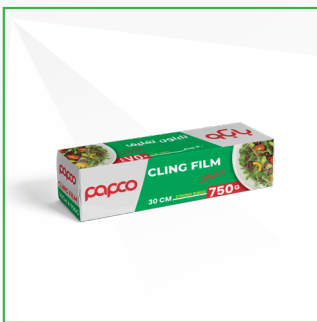
CF-01 30CM X 750G 11 Micron Carton Packing: 6

Our high-clarity cling film offers secure and hygienic wrapping for fresh food preservation in kitchens, restaurants, bakeries, and retail environments. It provides excellent stretchability and cling strength to seal containers and protect food from air exposure, keeping products fresh for longer.