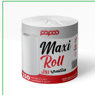
MR-2 250 Meter 1 Ply Carton Packing: 6