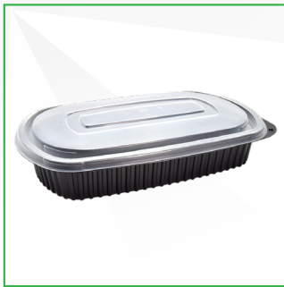
8000 32 OZ 1 Compartment Carton Packing: 250

Our meal containers provide a reliable and hygienic solution for packaging hot or cold meals. Made from durable, food-grade plastic with secure snap-on lids, they are ideal for restaurants, catering services, and meal-prep operations. Their sturdy construction helps maintain temperature, prevent leaks, and ensure safe transport.