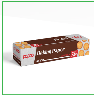
BP-02 45CM X 75M 40 Gsm Carton Packing: 6