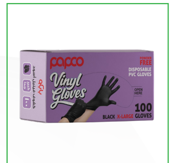
GBLK-XL X Large 100 Pcs Carton Packing: 10