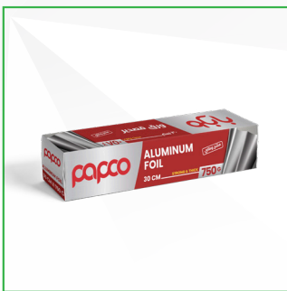
AF-01 30CM X 750G 15 Micron Carton Packing: 12

Our aluminum foil is designed to provide superior heat retention and protection for food preparation, storage, and delivery. Suitable for kitchens, restaurants, catering, and takeaway service, it helps preserve freshness and temperature while offering a clean and professional presentation.