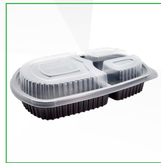
8020 32 OZ 3 Compartment Carton Packing: 250