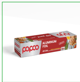
AF-02 45CM X 1KG 15 Micron Carton Packing: 6