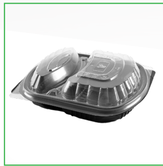
9010 36 OZ 2 Compartment Carton Packing: 250