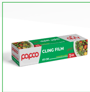
CF-02 45CM X 1KG 11 Micron Carton Packing: 6