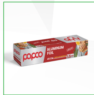
AF-03 45CM X 1.5KG 15 Micron Carton Packing: 6