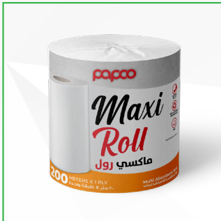
MR-1 200 Meter 1 Ply Carton Packing: 6

Our maxi rolls are designed for high-capacity usage in busy environments, offering strong absorbency and long-lasting performance. Ideal for kitchens, restrooms, and industrial spaces, they reduce the need for frequent replacement while ensuring efficient cleaning and drying.