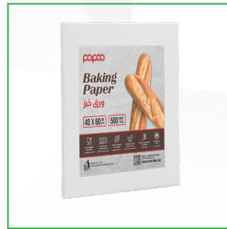
BP-03 40CM X 60CM 40 Gsm Packet Packing: 500