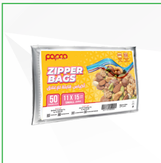
Small 50 Bags 11 X 15 CM 60 Micron Carton Packing: 24

Our zipper bags provide a strong, reusable storage option with an airtight, easy-open zipper closure. Designed for organizing, storing, and protecting food and non-food items, they offer convenience and reliability for both commercial and home use.