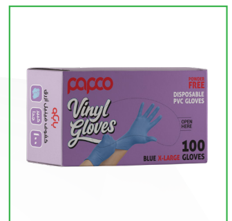
GBLU-XL X Large 100 Pcs Carton Packing: 10