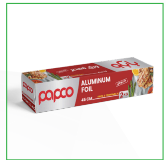
AF-04 45CM X 2KG 15 Micron Carton Packing: 6